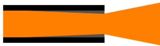
Improved Cylinder Choke